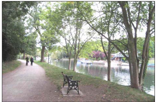
BEFORE: Our local Thames riverside, Autumn 2009

On many other parts of the Thames, the public are not barred from riversides where there are moorings.