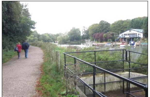
AFTER: The same length of riverside, Autumn 2014

What are your views? Would you like to see this stretch of riverbank open again for public access?