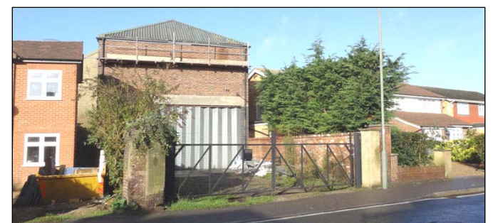
Thames Street warehouse, October 2014

If you have the odd hour or so, please email contactus@portmore.org.uk if you can help.